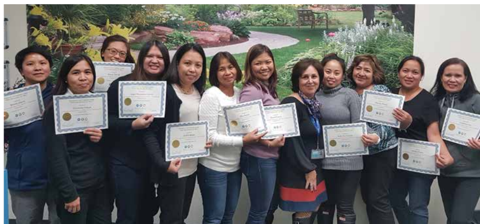
Person Centered Training at Mosaic with our front-line staff at our Resource Centre.

not stop at the person with the illness or injury. It includes the very important care partners or family caregivers. Their own health and social and emotional needs are related and impacted, and therefore have relevance and importance. Likewise, health care providers are also “persons” and attention